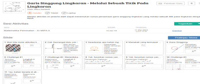
Figure 3. Students' worksheet Cycle II

divided into ten groups, with students themselves choosing groups, each group consisting of 2 or 4 people.