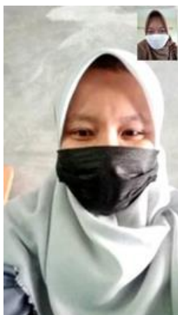
Figure 3. Interview with the teacher

Evaluation model is a model that is determined based on the program and objectives. The data obtained regarding the evaluation model is the result of data collection through interviews with 3rd grade teachers in SD IT Asshodihiyah Semarang.