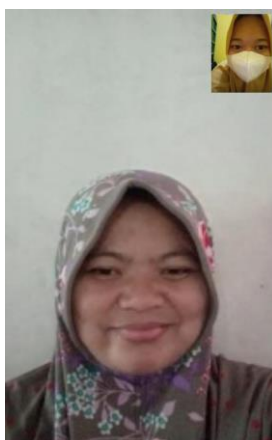
Figure 4. Interview with Parent

Evaluation of PBL-based Science learning that had been implemented in SD IT Asshodihiyah Semarang could not deny the fact that there were obstacles or problems faced by the parents of students in the process. Information about the obstacles in the implementation of PBL-based Science learning evaluation was obtained from the result of interviews with parents of 3rd grade students in SD IT Asshodihiyah.