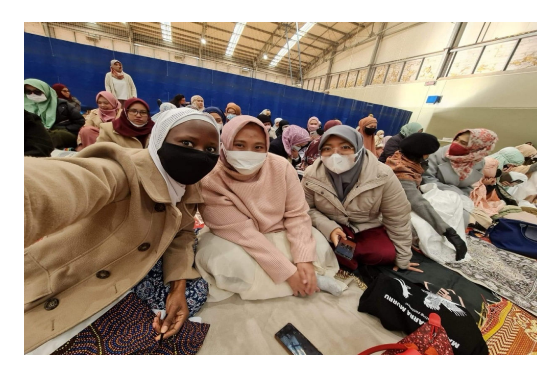
Figure 5. Muslims Diaspora in Canberra During Eid-Adha 2022

Nevertheless, as a diaspora residing in a distinct cultural setting, I derived pleasure from social gatherings in Australia. My favourite spots to socialise with other Australians include the various get-togethers in my neighbourhood and place of employment, such as morning tea, Australian football, Boxing Day, Canberra Day, and the upscale street in Belconnen where we watch Christmas displays. I also benefit from the abundance of sporting opportunities, as there are numerous clubs offering activities like hiking, skating, martial arts, kayaking, and kano.