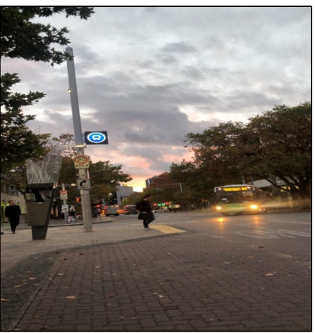
Figure 3. Intersections of Centre of Canberra, Total Separation of Pedestrians and Vehicle Activities

The implementation of complete pathway separation in certain areas of the city, particularly in the suburbs, serves as an additional motivation for individuals to engage in walking activities. Pedestrians are strategically positioned along the riverfront to improve the wide-ranging vistas and maximise the movement towards the destinations. Hence, the residents of Canberra exhibit a penchant for walking and tend to lead a health-conscious lifestyle. An exemplar of this practise is my supervisor, who is approximately 70-80 years old. During noon on certain days, I met my supervisor and questioned about his intended destination. He responded by stating that he was going for a walk during his lunch break. People in his age group are frequently seen roaming about campus at lunch or in the evening. Hiking is not an exception to this observation. During my journey in Black Mountain, I encountered individuals from a diverse range of age groups, including those between 70 and 80 years old. Remarkably, some of them were even use walkers while hiking.