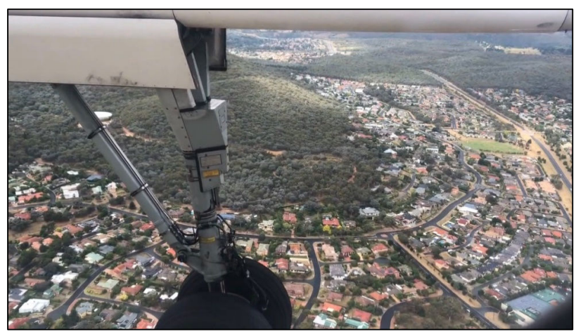
Figure 1. Aerial Perspectives of Canberra

Canberra is commonly known as the "Bush Capital" and its locally grown food is highly loved by residents. The phrase "Bush Capital" is also used in a satirical periodical that criticises the lack of walkability and entertainment options in Canberra, attributing them to the implementation of the Garden City concept (Muminovic, 2016). Upon contemplation of my personal encounter while above ground over Canberra, I was captivated by the urban layout that accurately portrayed the essence of a garden city. The hamlets are meticulously constructed and are encompassed by the gardens. The vehicle connectivity in those regions is commendable and visually appealing from an aerial perspective. However, it contrasts with the challenging experience of walking across the mountain, where there are no pedestrian routes or illumination available. Many more personal stories from other international students who choose to live in the suburbs without a car—especially one that is far from the city also relate similar situations.