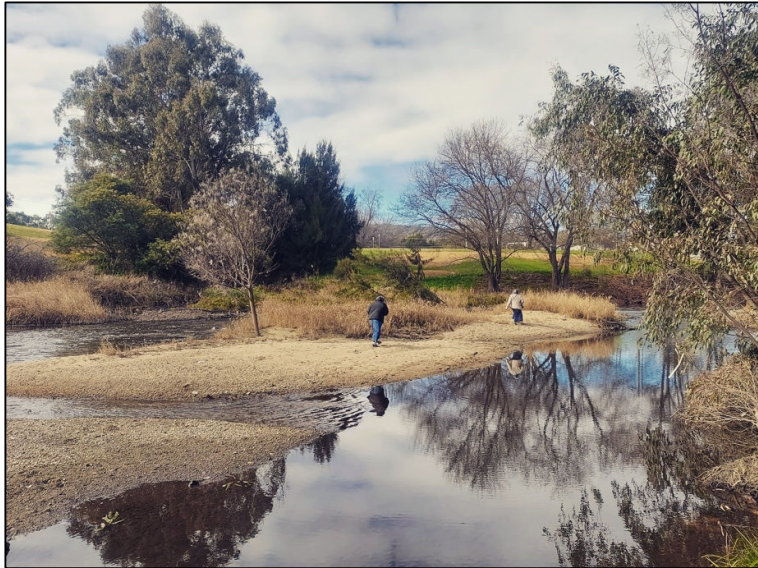
Figure 2. The Bush Capital

When evaluating a city's quality of life, the term "liveability" is commonly employed. It encompasses a number of factors such as public transit, affordable housing, green spaces, cultural amenities, and work prospects (Gough, 2015; Okulicz-Kozaryn, 2013; Ruth & Franklin, 2014; Tomalty et al., 2015). This word is frequently juxtaposed with the notion of sustainability. Several articles have elucidated the distinctions and resemblances between these ideas, such as Tomalty's paper on disparities in sustainability and liveability. Meanwhile, Gough describes such notions in a more practical manner (Gough, 2015; Tomalty et al., 2015).