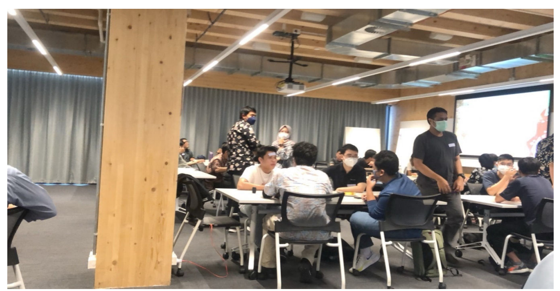
Figure 4. Indonesian Diaspora in ANU Activities Via ANUISA

When this sub-chapter came to mind, I jotted down a list of indicators that I wanted to emphasise. These factors encompass social and religious activities, sports amenities, cultural amenities, halal/halal-compliant food and beverages, consumer products and services, and opportunities for engaging in natural environment activities. Nonetheless, providing comprehensive narratives for all of my experiences within this paper is futile. Therefore, I have simplified my assessment into three unique categories: social and cultural aspects (encompassing religious practices, availability of sports and cultural activities), consumer goods and services (including halal or halal suitable food and beverages), and lastly, engagement with the natural environment. Things that happened to me in the first group (social and cultural life) have amazed me. In Australia, more especially in Canberra, I have no trouble finding Muslims or Indonesians, to the point where we behave strangely among ourselves. This is unpopular in our culture since it is mandatory in my community to treat one another as if we are blood relatives. It is required that individuals exchange pleasantries with a smile. We only considered folks as strangers while we were in our own nation because of the large number of people with similar identities. I assumed that this phenomena, which I discovered in Canberra, represented the multitude of Muslim communities and their cultural