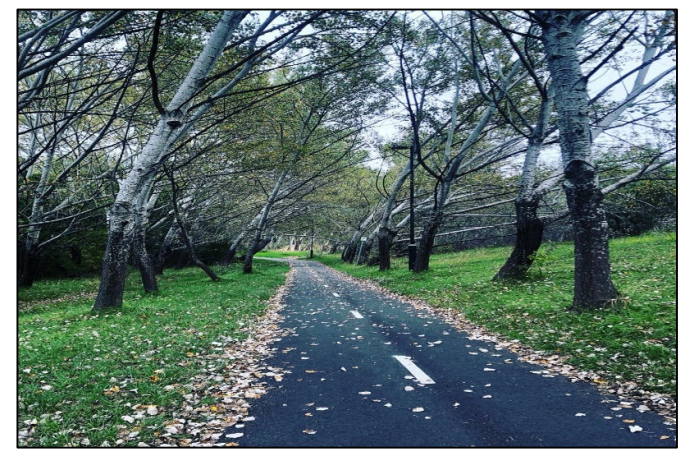
Figure 6. Nature Pedestrian Based in Canberra

I have at least two indicators that reflect my thoughts on the liveability of infrastructure. The two primary indicators are the standard and regularity of public transportation and the accessibility and reasonable cost of high-quality housing. I've travelled to a number of other nations, including Portugal, Singapore, Spain, Sri Lanka, China, and Malaysia. Based on all of my experiences, living abroad with a small budget means that we have to rely on two things: "How much will I pay for housing?" and "How easy can I travel anywhere there?" In certain Asian nations, the cost of housing may be lower than that of transportation. This is a result of the scarcity of reliable public transit options. Most of them offer various routes but lack sufficient frequencies and high-quality public transportation. Opting for a private chartered vehicle is frequently the most cost-effective and comfortable method of travel.