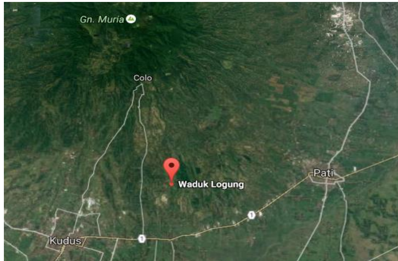
Figure 1. Location of Logung Dam (Google Earth)

The location of the work is at the downstream of the River Logung encounter with the Gajah River in Dukuh Slalang, Tanjungrejo Village, Jekulo District with the position of 06o 45 '28.38 "LS and 110o 55' 20.27" BT. While the inundation area into the area Hamlet Sintru, Village Kandang Mas, Dawe District and Dukuh Slalang and Village Tanjungrejo, District Jekulo all of which entered in the area of Kudus District. To go to the project location can be reached by landline. It takes about 2 hours from Semarang City to get to the project location with 2 or 4 wheeled vehicles. Whereas from Kudus City can be reached for 30 minutes as far as + 15 km or from the Kudus - Pati Highway entering as far as + 5.5 km towards north up to Dukuh Slalang Desa Tanjungrejo