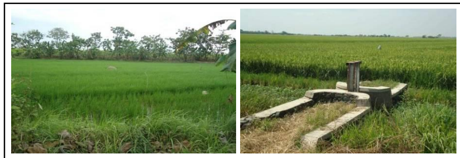
Figure 2. The Potential Of Agriculture In The Wedung Sub-Districts