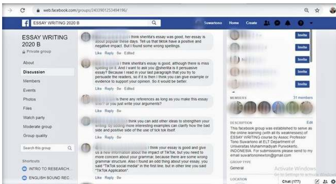
Figure 2. A Sample Discussion Forum

Beyond the screenshot coverage hundreds of discussion chats were made by class participants. They seemed to be enthusiastic and keen on asking for clarification, sharing ideas, and giving advice for betterment. Some highlighted content; others, however, paid more attention to language use or generic structure of the essay posted (see Figure 1 above). This discussion might turn into a serious end, so accordingly the teacher returned to lend a hand. Sometimes, a session of 100 minutes ended while the participants still seemed so busy discussing their topic of the day.