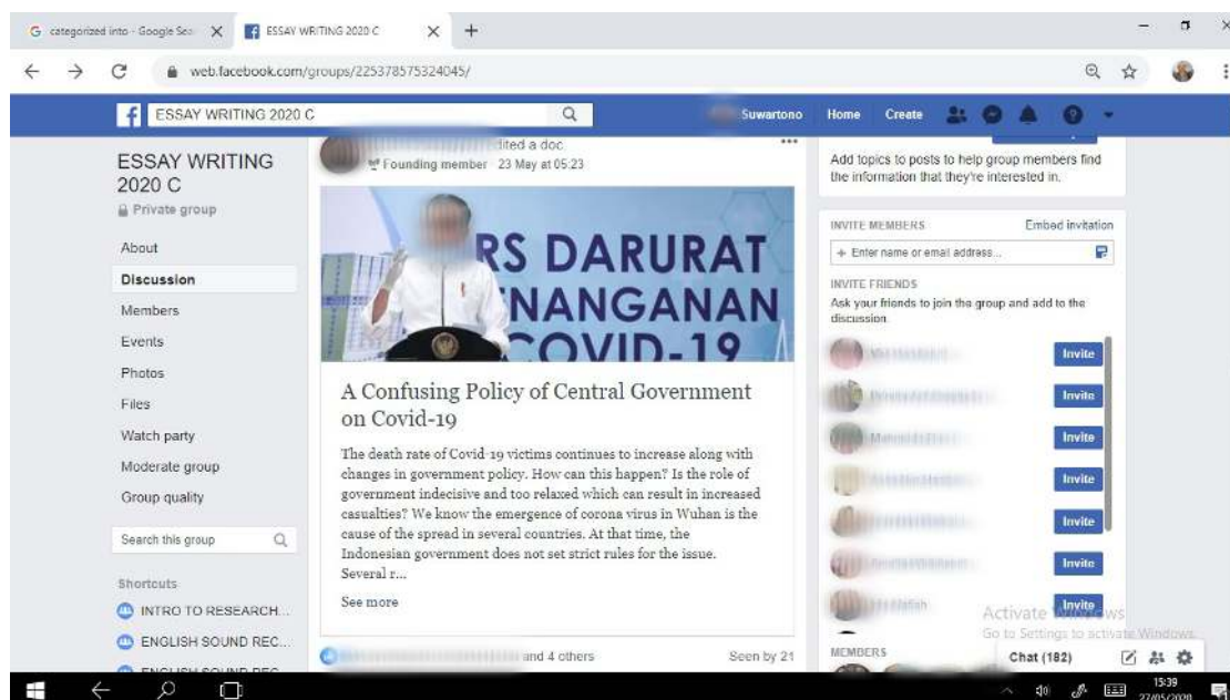
Figure 4. A sample student's essay in 'Create Doc' Professional Look

Students' excitement was seen from number of seers (bottom right), reactions (bottom left), and comments (below beyond coverage) on others' works. They really learned from each other. No wonder their writing ability progressed rapidly in spite of observed faults, mainly a few grammatical errors. Overall, other writing components were already good. This amenity available on FbG would have brought them a joyful learning and sense of accomplishment. They learnt to write English essay effortlessly and proudly due to professional, authentic look works, just like to say "Great, I can do it". From learning process point of view, this result tended to show acceptability in the part of students. Nevertheless, it is always necessary to examine its results for better acceptability worldwide (Reddy et al., 2020).