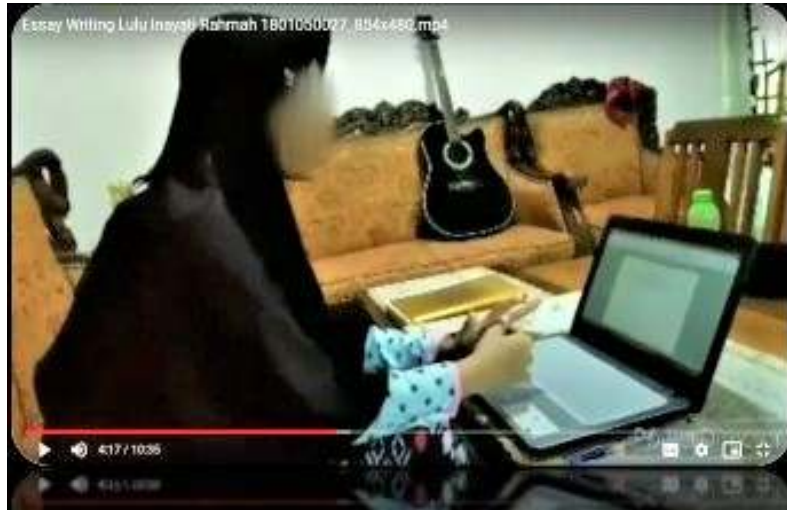
Figure 3. A sample video of student's essay writing process

print screen that demonstrated how a student wrote her essay in a detailed step-by-step process.