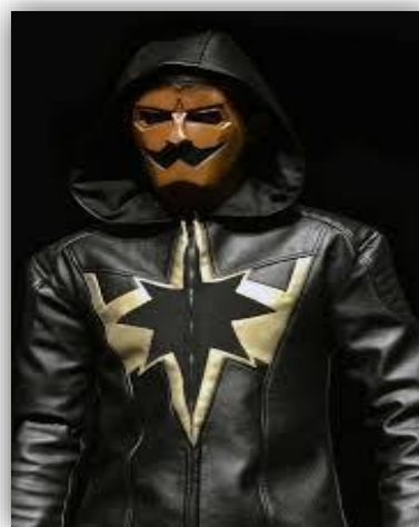
Figure 11. Modern Concept of Gatotkaca by Charles Gozali