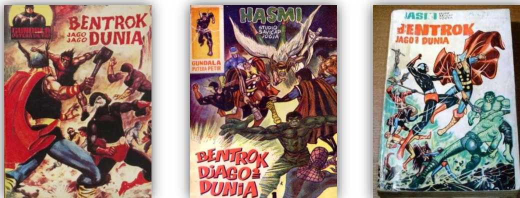
Figure 1: The depiction of a crossover between Indonesian superheroes and American superheroes in the 1970s in some of the Gundala Putra Petir comics by Hasmi

Here are the examples of concept of original, borrow, traditions in the work of fiction: