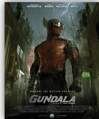
Figure 9. Remake of Gundala Movie in 2019 by Joko Anwar