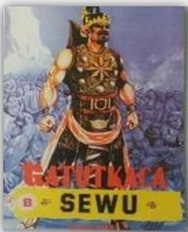
Figure 10. Initial Concept of Gatotkaca by R.A Kosasih

These two pictures below are a comparison of the initial concept of R.A. Kosasih's Gatotkaca with the modern concept by Charles Gozali: