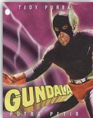
Figure 8.1 st Gundala Movie in 1981 by Lilik Sudjio