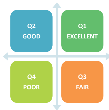
Figure 1 Maslahah-Efficiency Quadrant (MEQ)

Having efficiency and masalah analysis in one basket, therefore, the analysis framework of this study will be referring to the following figure 2 of quadrant: