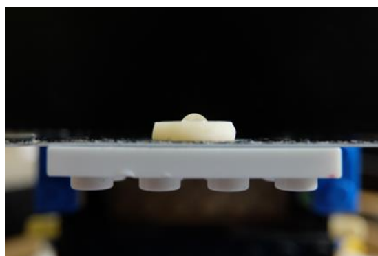
Figure 1. Contact angle measurement of Group I