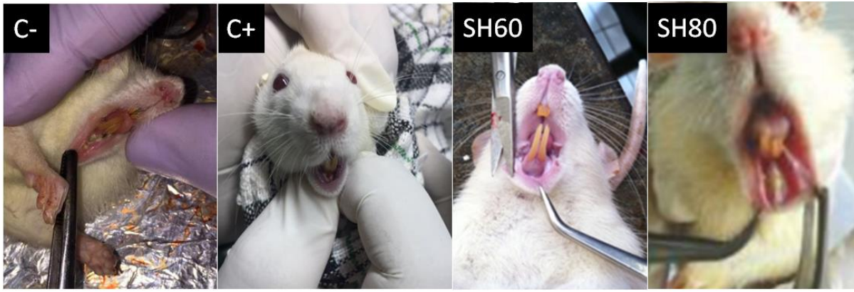
Figure 1. Image of ulcer formation on day 6