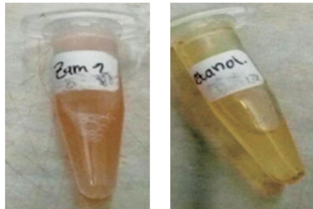
Figure 1. CZE in zam-zam and ethanol solvent were diluted with RPMI 1460 medium at T47D cell line cytotoxicity test.

Fifty grams white turmeric ( Curcuma zedoaria ) powder were infundated with 300 ml of zam-zam solvent for 15 minutes, then filtered using a paper